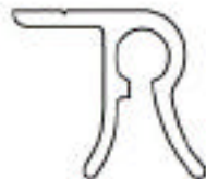
In Jam Mount

Additional mounting systems are available, including: Sliding Door Tracks; Bi-Folding Systems; Swing-Away Brackets; and Vestibule Brackets to fit any application.