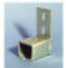
End Mount Brackets Galvanized