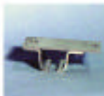
Ceiling Mount Bracket Galvanized