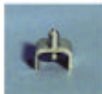
End Stop Galvanized or Stainless Steel