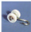
Hook Wheel Galvanized or Stainless Steel