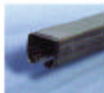
Roller Track Galvanized or Stainless Steel