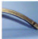
Radius Track Galvanized or Stainless Steel