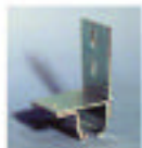
Wall Mount Brackets Galvanized