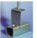
Threaded Rod Brackets Galvanized