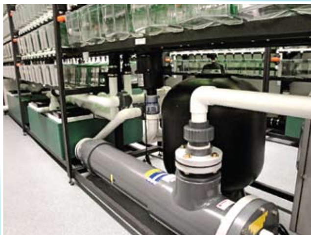
under rack filtration