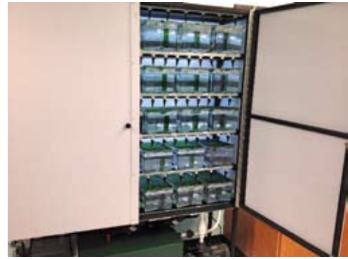
light cycle cabinets