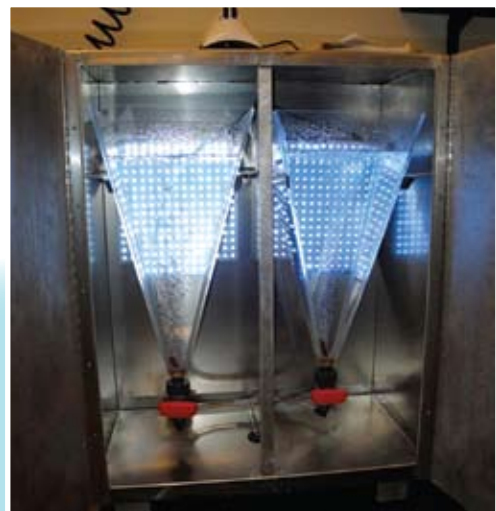
brine shrimp hatcheries