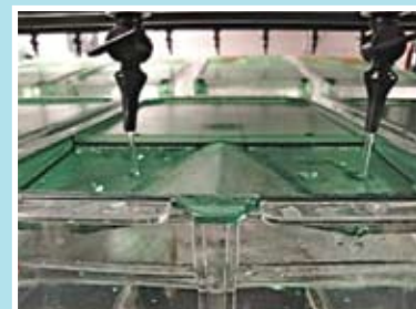
tube-less water delivery