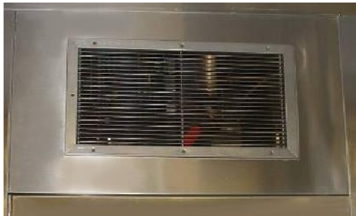
Stainless Steel Louver Vent