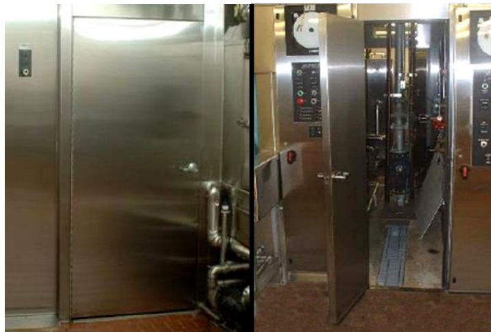
Stainless Steel Access Doors