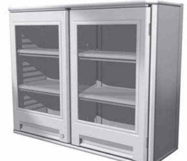
Double-wide Overhead Cabinet with Polymer Shelves and Locking, Clear Doors