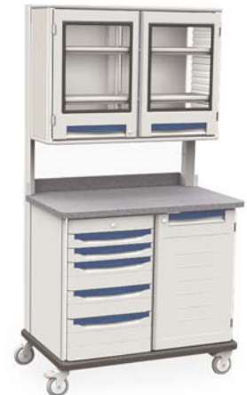
Model # SXRMENT2 with SXRDOH27P Overhead, (2) SXRDOHPS Shelves and Clear Locking Doors

* Triple-wide overhead cabinets are only offered as part of Mobile WorkCenter offering. Contact your Metro representative for more information.