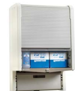
Tambour Door Overhead (Also available on Mobile WorkCenters)